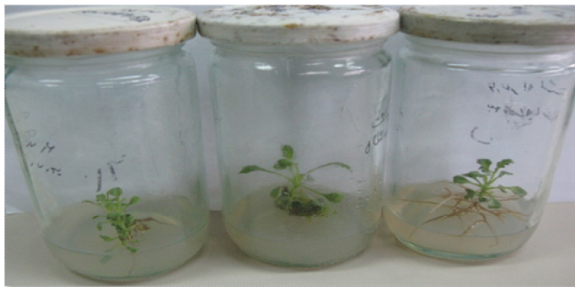
Figure 3: tashnedari regenerated seedlings on hormonal treatment (0.5 BA + 1 IAA mg/l)