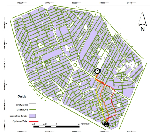
Fig 4. Optimal Routing in real web

Then using genetic Algorithm, 3 best routes have been determined in which the route which is clear by color red is the best route between the damaged spot and safe place and considering the passage width and population density is low.