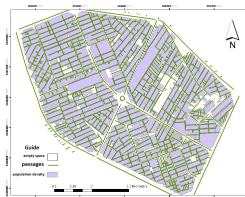
fig 3. kerman area 3

Kerman's GIS data base. Then for using them local information of the blocks and crossing of the streets and also local information of safe places center are considered the considered are a includes building nodes, safe place node and urban passage or nodes of the graph.