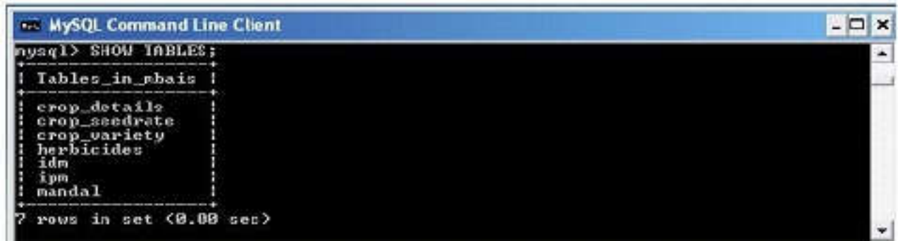
Fig 3: Tables in the Database MBAIS created