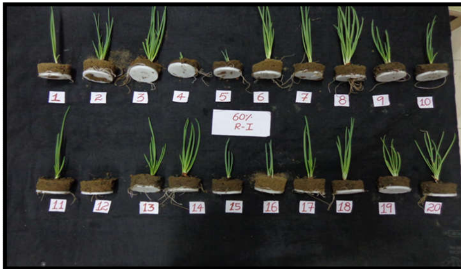
PLATE 3. ROOT PENETRATION ABILITY OF ONION GENOTYPES FOR VARIOUS 60 % CONCENTRATION