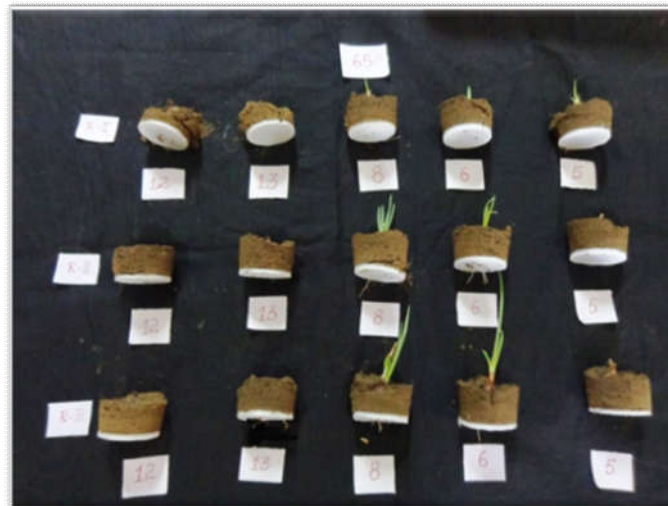
PLATE 4. ROOT PENETRATION ABILITY OF ONION GENOTYPES FOR VARIOUS 65% CONCENTRATION