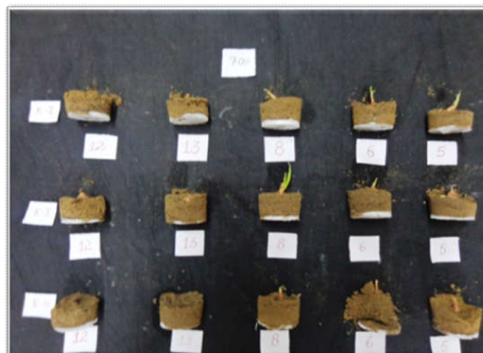
PLATE 5. ROOT PENETRATION ABILITY OF ONION GENOTYPES FOR VARIOUS 75% CONCENTRATION