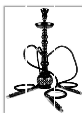
Figure 1. A 3-hose hookah

The purpose of this study is to find the overall oral health effects of hookah smoking, with chiefly concentrating on the periodontal effects.