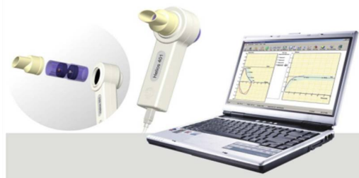
Figure 2: Pulmonary function test machine- Helios 401

Data collection was done in the month of February 2019 at different places in Delhi for males and females which were East Delhi -Male population: Shastri park CISF DMRC headquarter and males hostel, Female population: Shastri park CISF DMRC headquarter and females hostel, West Delhi- Male population: Dwarka CISF DMRC office near kakrola village and males hostel, Female population: CISF complex mahipalpur bypass road, DMRC lady hostel Barrack 3, North Delhi – Male population only at CISF males hostel near Rithala metro station, South Delhi – Male population: CISF camp Harkesh Nagar Okhla, near Govind Puri metro station Female population: Girls CISF camp Jasola. Figure 3 shows an image of CISF personnel performing PFT.