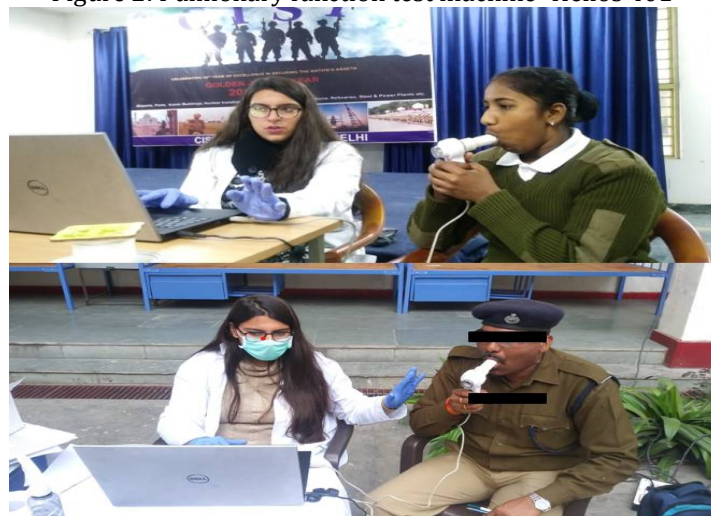
Figure 3: CISF personnel performing the pulmonary function test