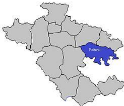
Figure 1- Map of the study area

The area under the study is an ideal religious place famous for diverse flora of ethno-medicinal significance. It is situated at distance of 65 km on North-eastern side of Ahmednagar district (M.S.) India. It covers an area of 1214.10km 2 (i.e 468.8 miles 2 ) and lies at an altitude of 394-413 meters from MSL (Mean Sea Level) and is located in between 20°38'38"N-20°46'31"N latitude and 75°93'47"E-75° 99'78"E longitude. The area under the study is occupied by forest area of 64.26 km 2 with 42.5% mixed-deciduous forests with an average rainfall of about 595mm (2004) and temperature range of 22°C to 41.8°C [2]. So far the study concerned, area under the study is unexplored up to today.