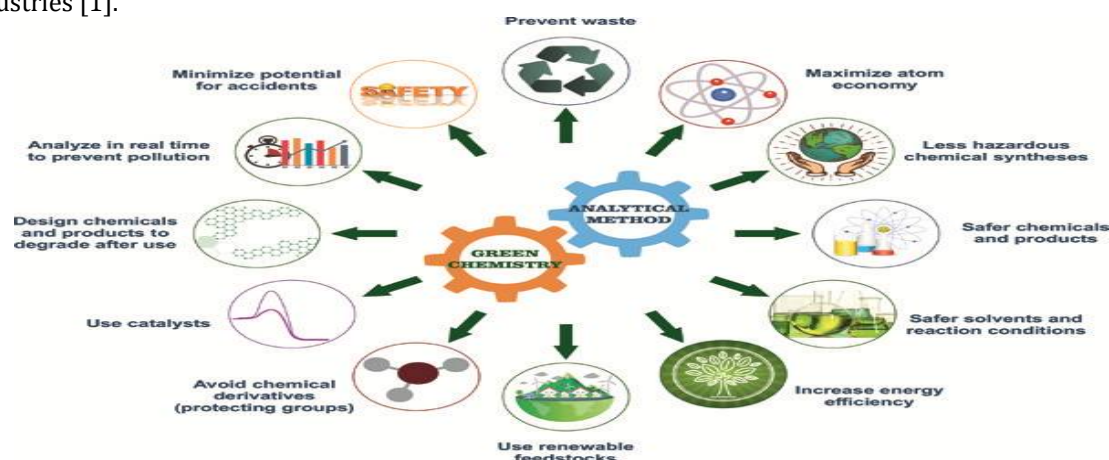
Figure-1- Application of chemistry in different industrial fields

Over the past century, chemistry has developed into a discipline that significantly contributes to modern life. Among the countless applications of chemistry in daily life, the pharmaceutical industry contributes the most to public life. With advancements in analgesics, antibiotics, cardiac medications, and most recently Viagra. Viagra is a very new addition to this list. It is difficult to imagine any part of modern life that has not been influenced in some way by products produced by the chemical industry and allied industries [1].