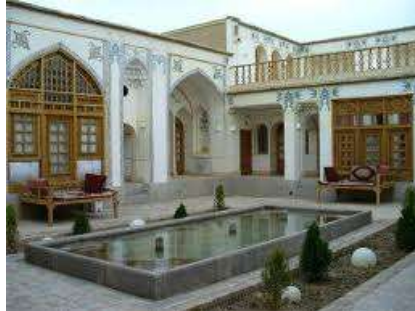
Fig.1 Iranian courtyard

one leaves the windows looking on the courtyard, he will make it possible for the natural two-sided air current to flow freely. This will slump down the intensely high temperature in interior spaces of building. "Shaping minor divisions of urban context has obeyed from organic order, while the empty cores within these components have been formed from regular forms in relation with the quadruplet directions. [3] Another difference is that in humid regions, the central courtyard is designed as more compact, and smaller. One reason for it is facilitated way of trees irrigation and permanent predominance of shadow in hot season. The traditional Iranian courtyard is an example of the void in architecture. As a matter of fact "negative space" of the courtyard, surrounded by rooms as "positive". [4]