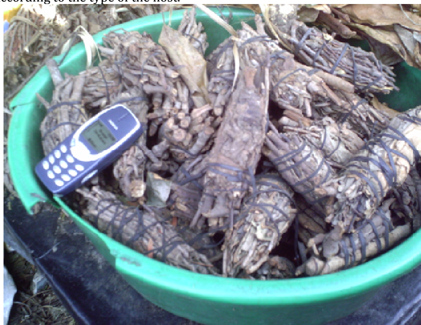
Koumassi-Abidjan

During a visit to the markets of medicinal plants in Abidjan (Figure 3), packets based on mistletoes branches were observed. Each packet consists of both the branches of the parasitic and those of the host on which the parasitic has been harvested (Figure 3). The cost price of each package is at least 500 F CFA and increases according to the type of the host.