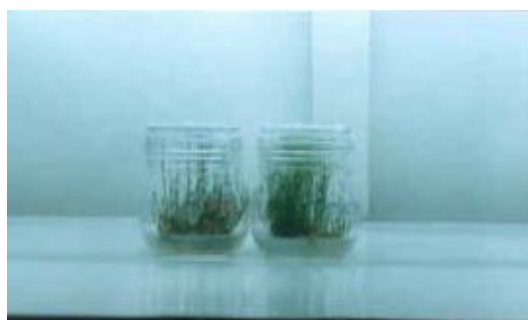
Figure 2 : Root regeneration on callus in Asparagus sp.

The outcome of the result analysis, indicate that in order to suitable callus induction and plant regeneration and also produce strong roots in the asparagus plant, the combination of auxin and cytokinin are necessary. So, production of regenerated plants with just one of the plant regulators ( Auxine or Cytokinin ) is not successful and this is meet by the results of Bojnauth et al and Reuther et al studies. Therefore, it is recommended that, to increase the percentage of plant regeneration and rooting of asparagus, different concentrations of plant growth regulators and different explants of asparagus should be examine.