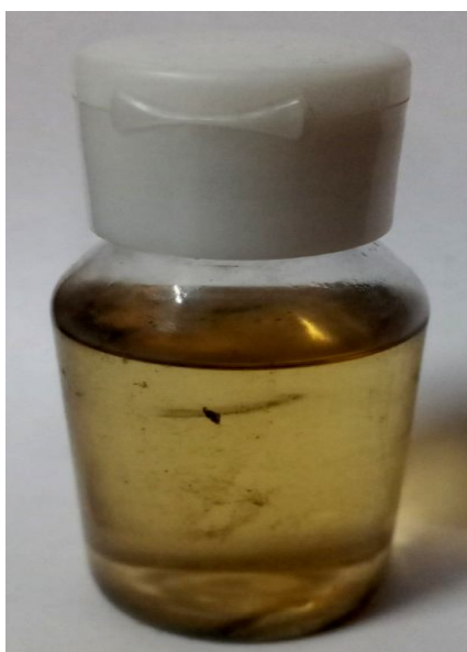
Figure No. 1: Anti-dandruff Polyherbal hair oil

Microbial contamination test: It is the vital test for detection of the ability of the preparation if it is capable of having antidandruff properties, for this test weigh accurately 4.5 gm of agar powder and 1.96 gm of nutrient broth to 150 ml distilled water. Boil for 10-20 min, keep for autoclave at 121 degrees Celsius till 15 min to make it aseptic, Petri plate should be disinfected by putting them in a hot air oven for 20 minutes. Make 3 plates, 1 st plate there is agar, 2 nd plate there is nutrient agar and microorganism collected by cotton running on scalp containing dandruff. In the last plate, there is agar and microorganism in which well is made with the help of cork and herbal anti-dandruff oil is added to it. Incubate for 24 hrs, observe zone of inhibition in last Petri plate and record [14-16].