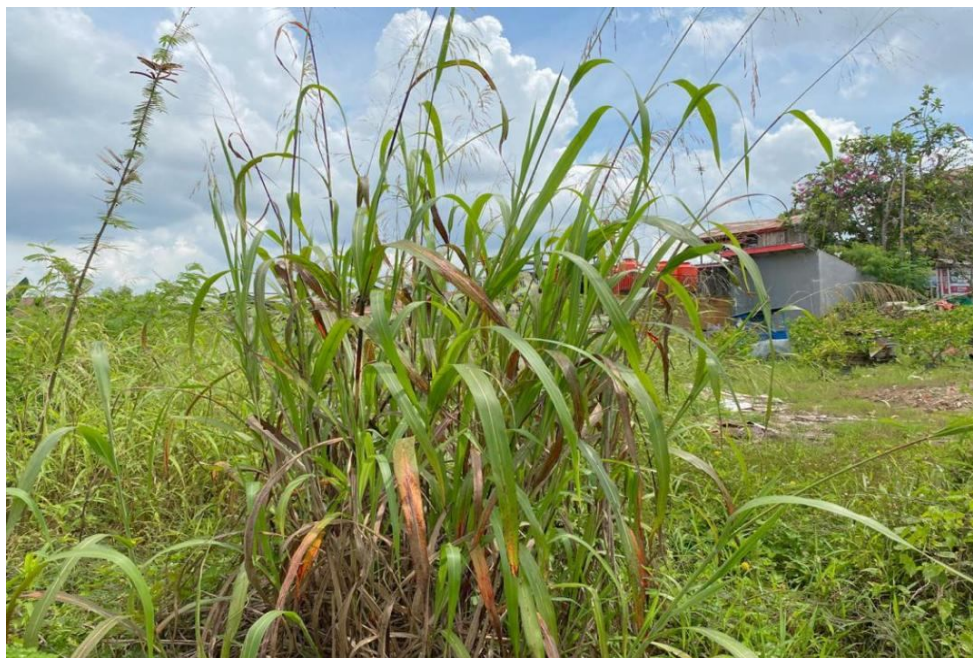
Figure 1. Gelagah Grass ( Saccharum spontaneum L.)

Gelagah grass can grow in a variety of environments, both tropical and non-tropical. Gelagah can reproduce generatively through seeds or vegetatively through stem cuttings. Gelagah are tall perennial grasses with deep roots and rhizomes that do well in marginal soils such as rocky areas, deserts and sandy flats, where no other plant can be grown or cultivated. Therefore, gelagah can be considered as a drought-tolerant, perennial grass. Gelagah have a high carbohydrate content, making the biomass of this species a suitable substrate for ethanol production [8].