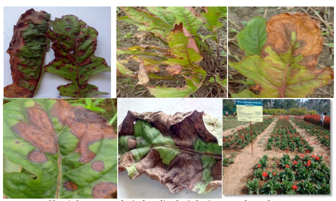
Plate 1. Symptomatological studies for infection on gerbera plants.