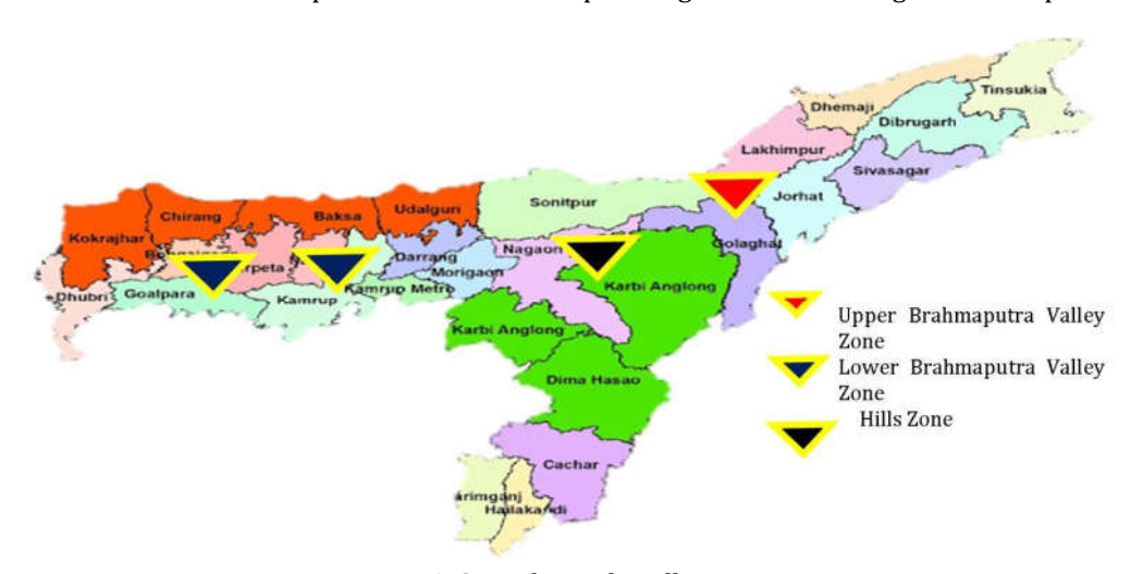
Fig. 1. Site of sample collection.

The infected section were surface sterilized with 1% sodium hypochlorite for 30sec [6] and then section were rinsed with sterile water thrice under aseptic condition for remove the sodium hypochlorite. After that section were inoculated in sterilized petri plate containing potato dextrose agar(PDA) media and kept for incubation at room temperature 23±1°C for upto full growth of the fungus into the plate.