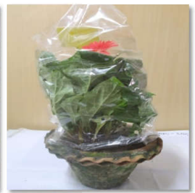
Plate 8. Spray inoculation