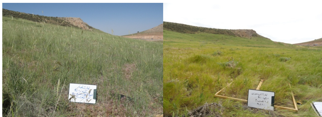
Figure (1): images of control area (left hand) and fire area (right hand) in Zaghe site in one picture