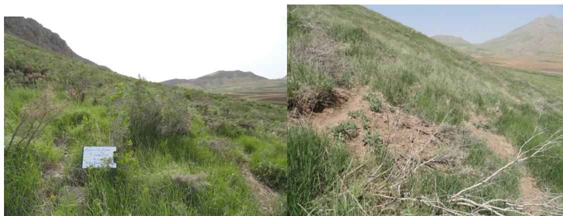
Figure (2): image of control area (left site) and fire with uncovered blotches and bare soil (right side) in Farakash site