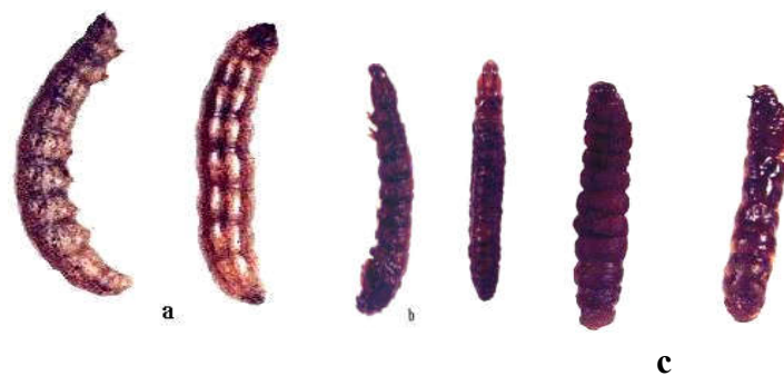
Fig.1. Morphology changes in malformed of the 4 th instar larvae of Spodoptera littoralis treated by pomegranate juices:

Means within each row followed by different letters were significantly different at P < 0.01.