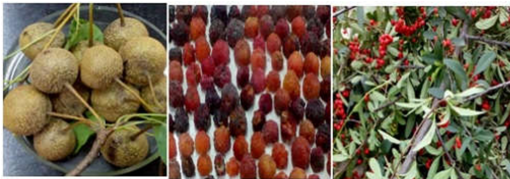
Fig.1.(a) Pyrus Pashia (Mehul) ,(b) Pyracantha crenulata (Ghingaroo), (c) Rubus niveus (Kala Hisalu).