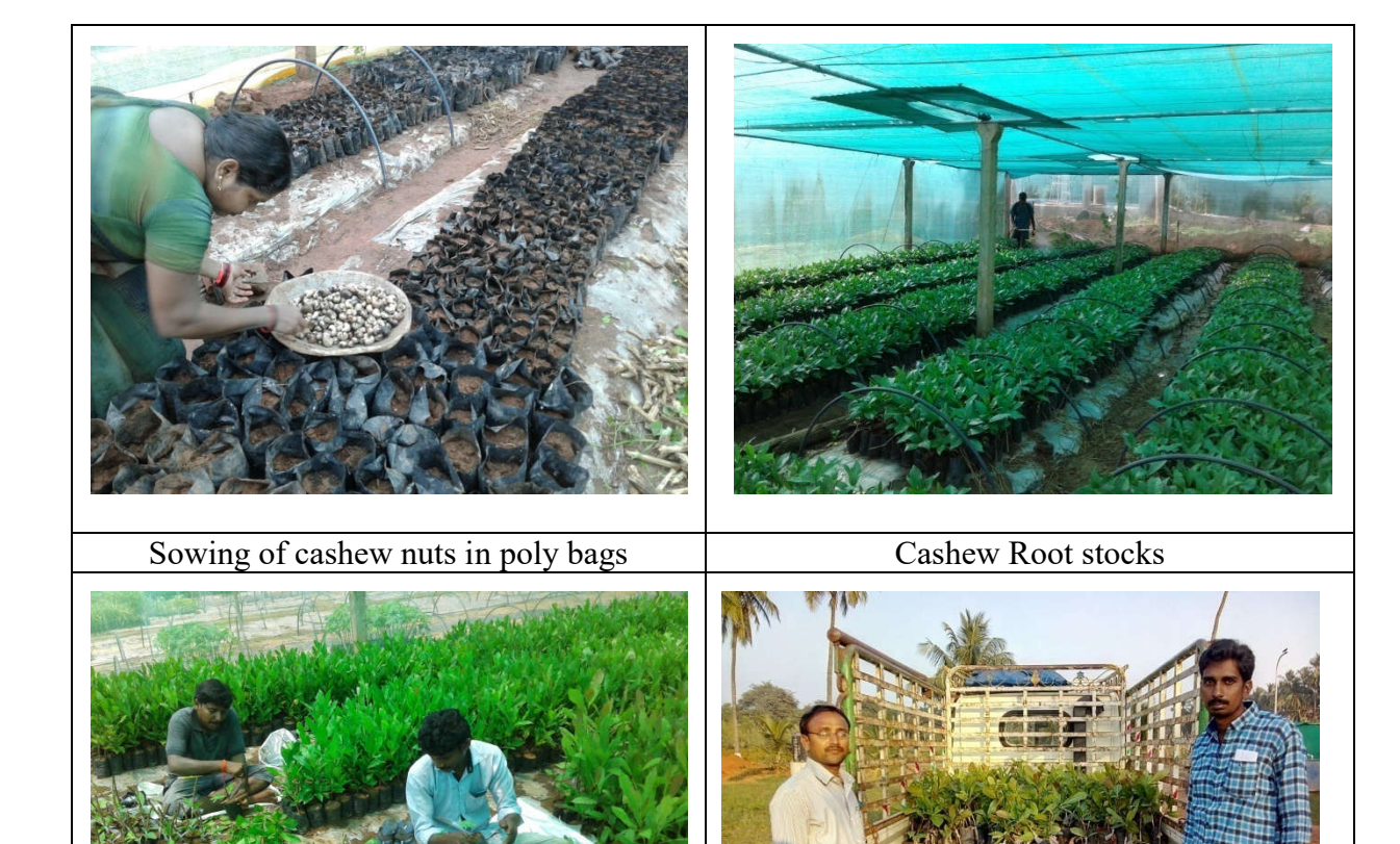
Plate 1: Figure showing different operations involved in cashew grafts production