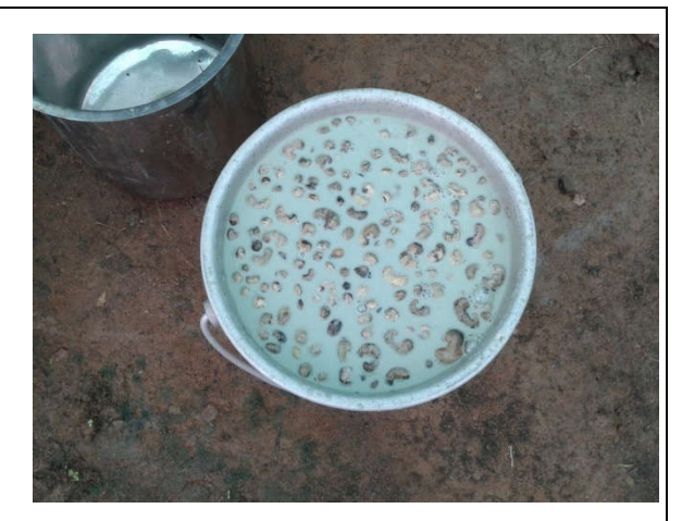
Dipping of nuts in Copper oxy chloride solution