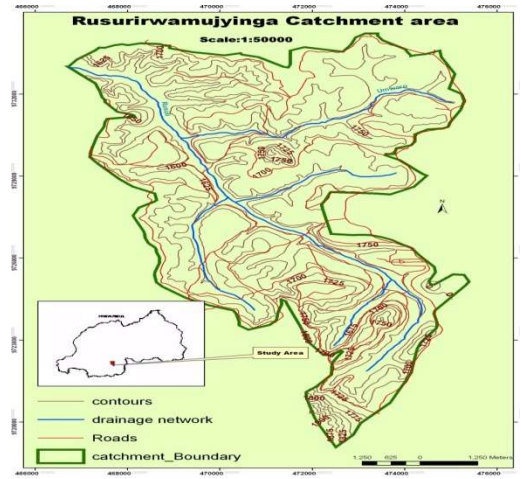
Map of the study area

Rusurirwamujyinga Sub-catchment occupies an area of 67.171 Km<sup>2</sup> and has population of 84,313 people who reside within Rusatira, Ruhashya, Rwaniro and Kinazi sector of Huye District in the Southern Province of Rwanda, upper Mwogo catchment area, which plays major role in regulation of water flow to Nile basin. Geographically, it lies between longitudes 29° 40' 0" and 29° 48' 0" East of Greenwich and between latitude 2° 23'50" and 2° 31'58"S South of the Equator. Altitude varies between 1200-1700 m above sea level and the average annual precipitation is 1171mm. The sub-catchment area is drained by Rusurirwamujyinga River which has several tributaries such us Gasuma, Akogo, Gahama, Gatare, Nyakagezi and Umwaro. The whole drainage area covers about 608 ha and the rice irrigated area covers about 400 ha. ( see the map of the study area depicted for the map of Rwanda).