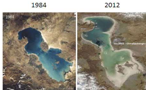
Figure 1: Water level decline of Urmia lake, based on satellite images

1955 to 2007 show an overall decreasing trend in area from 5800 km 2 to 4017 km 2 and this leads to appearance of 1800 km 2 salt marsh on adjacent lands [13]. The lake is threatened and has been demolished by the two groups inside and outside the system. The inside system agents which are the part of the essence of the lake system includes climate features, water resources, wildlife, vegetation, etc. The changes occurred in the characteristics of these agents has caused changes in the lake system [14]. So that 65 percent of the decline was from changes in inflow caused by climate change and decreased precipitation over the lake itself (10%) [15]. In addition, the outside agents of the system is imposed from outside the system, these agents are man-made and are going to be dried by human exploitation such as overuse of surface water resources, and dam constructions and etc [14]. So that, construction of dams as one of the human intervention in this area allocated 25% of the degradation of the lake [15]. In this regard one quarter of the lake has changed to saline area in the last 10 years [6].