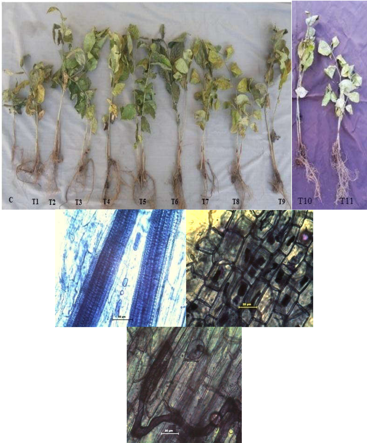
Fig. 1: Growth response of Holoptelea integrifolia seedling under different treatments at forest pathology nursery, Tropical Forest Research Institute, Jabalpur (MP) (A) Seedling after 4 months; (B) Length of different treatment plants after uprooting of seedlings (C) Presence of vesicles (D) Presence of arbuscules (E) Presence of hyphae