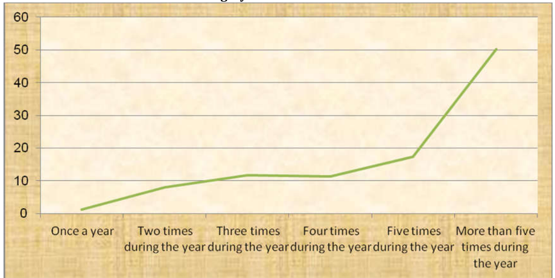
Diagram 1- Distribution of frequency percentage for the participants' referring to the physician during a year in this research.

7- According to the data obtained (extracted) from the questionnaire which its results are observed in diagram 2, medicine targeting (payment of medicine cost by the government through the insurance companies) had not meaningful (significant) effects on kinds of most consumed (used) medicinal groups such that in all four groups of most consumed medicines (drugs), more than 50 percent of patients believed that its effect was very low up to middle.